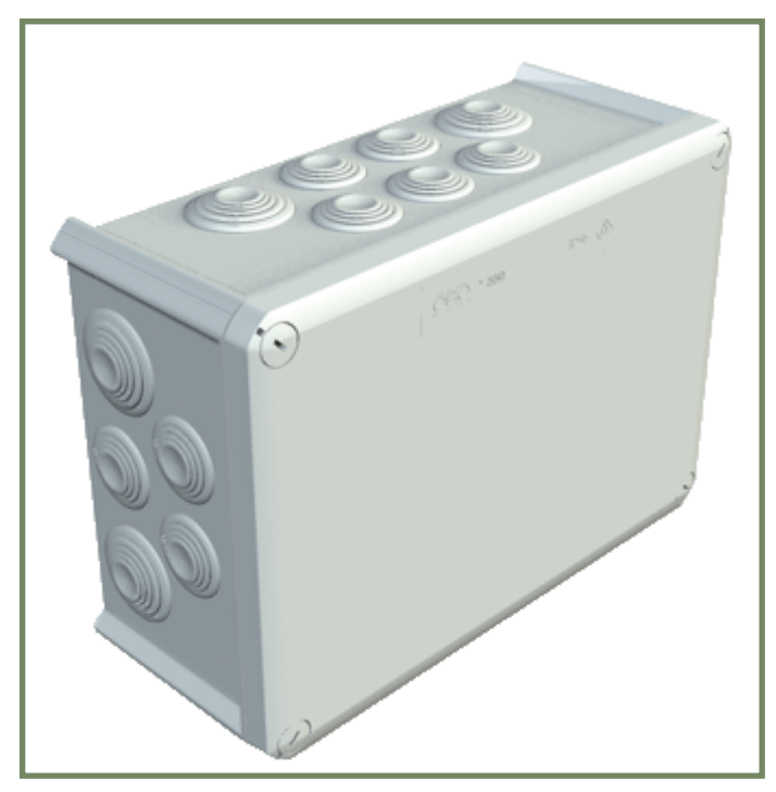
Figure 2 - Mounting box