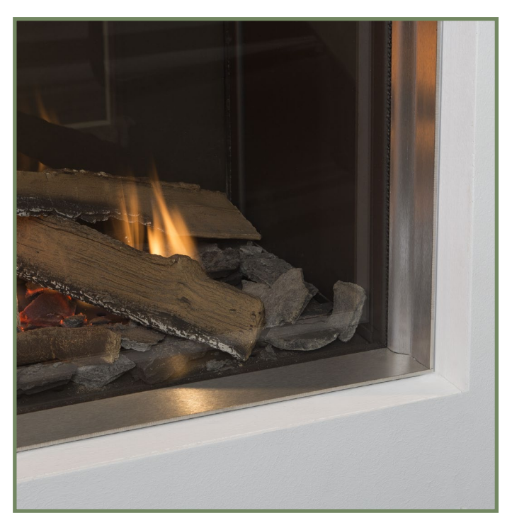
Figure 3 - Example Stainless steel trim