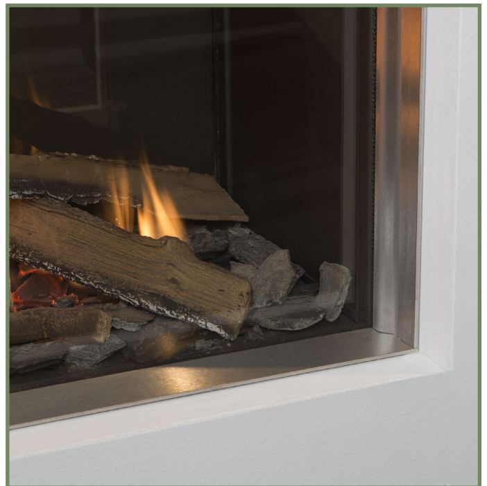
Figure 3 - Example Stainless steel trim