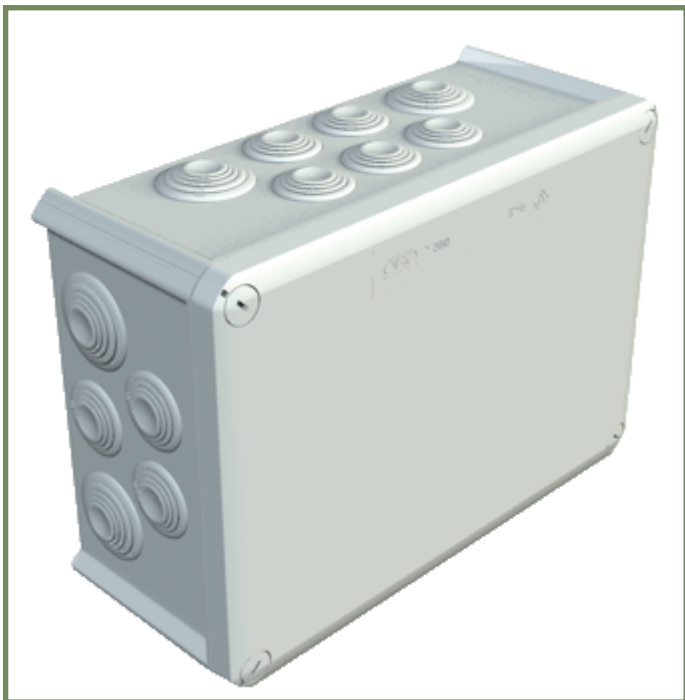
Figure 2 - Mounting box