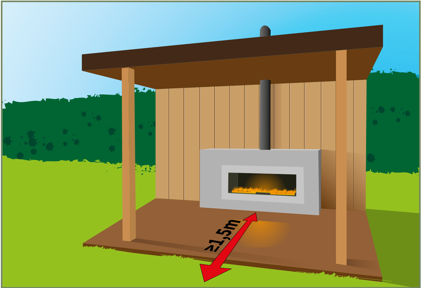
Figure 1 - Minimal dimensions for overhang with outdoor fires